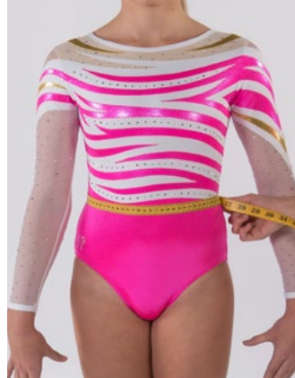
WAIST Measure around waist at navel.