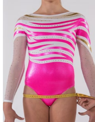
HIP Measure around the fullest part of buttocks.