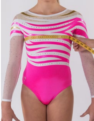
CHEST With arms by side, measure around the fullest part of chest.

The aim of measuring your athlete is to find the most appropriate size based on the size chart below. Please ensure that athletes are wearing fitted apparel during the measuring process.